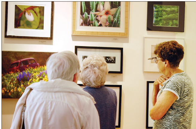
Visitors view photographs at the Open Regional Exhibit on May 8, 2014, at Pendleton Center for the Arts. Submissions for the 2022 gallery show will be accepted April 2, noon to 4 p.m.