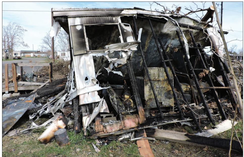
A toppled and burned mobile home sits in Irrigon on Thursday, March 10, 2022, days after a fire.