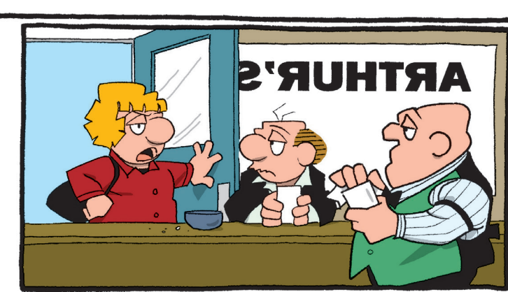
"THERE'S NO 'I' IN ARTHURS,