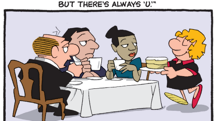
"LORETTA'S SPECIALTY IS UNJUST DESSERTS."