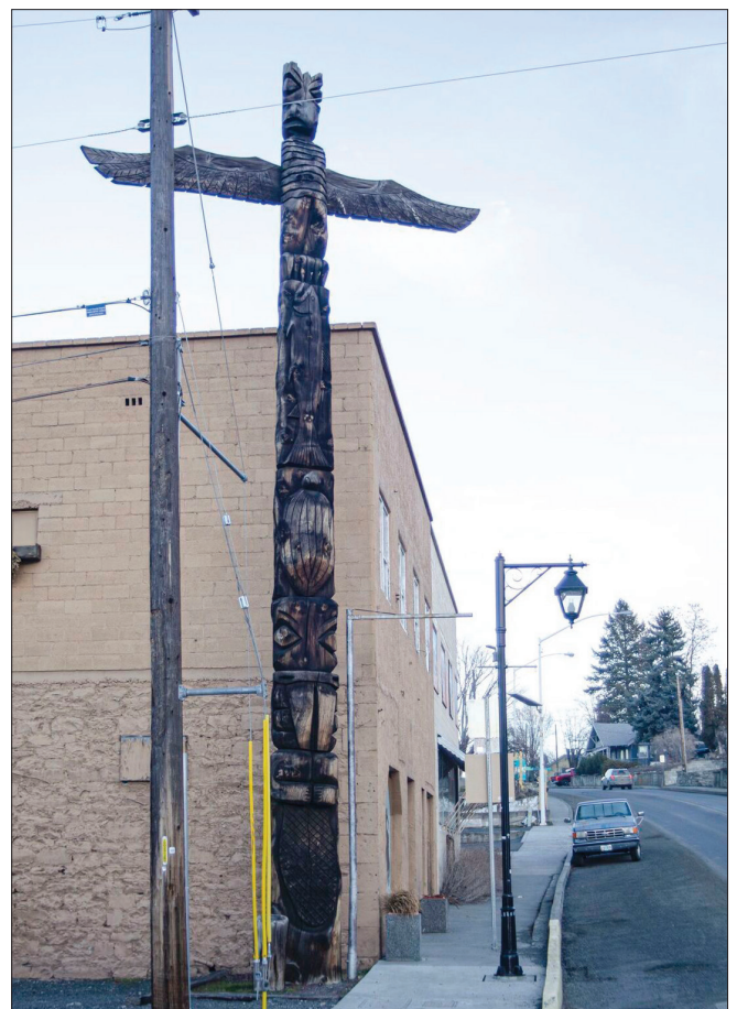
The John Day totem pole is showing its age, but the city has plans to clean it up and refinish it this spring. There also are discussions about possibly moving it to a more prominent location.