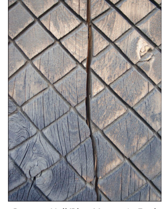
The totem pole's unprotected wood has been badly weathered by the elements.