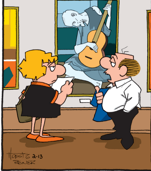
"WHY'S THIS CALLED 'MODERN ART'? PICASSO PAINTED IT IN 1903."

"THANKS, LEROY, BUT I DON'T NEED A WARM-UP ACT."