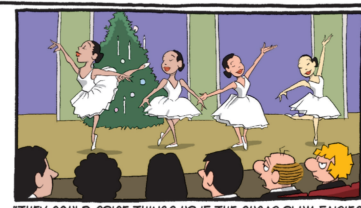
THEY COULD SPICE THINGS UP IF THE SUGAR PLUM FAIRIES FACED OFF AGAINST THE PACKERS."