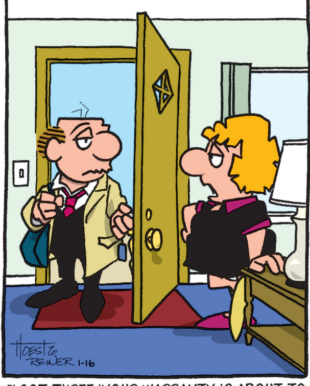
EXPIRE' CALLS AND A HEARING AID OFFER IN THE MAIL. HOW WAS YOUR DAY?"