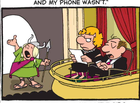
"FEEL FREE TO POKE ME IN THE RIBS WHEN IT'S OVER."