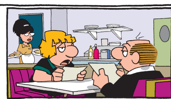
"LET'S SHARE AN APPETIZER AND JUST KEEP ASKING