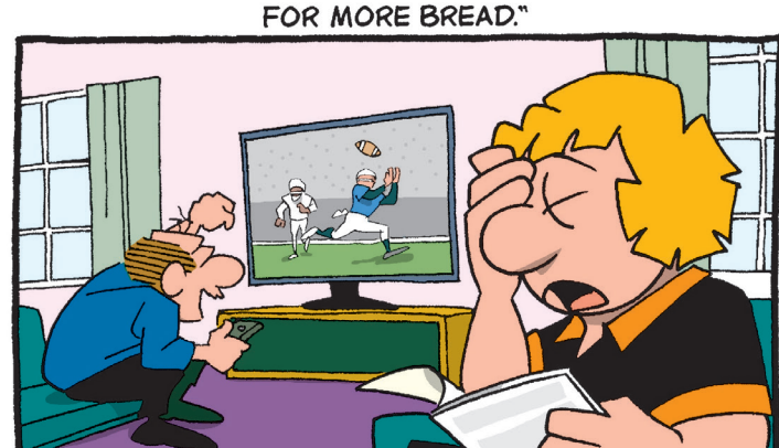
"LET THE GAMES BEGONE."