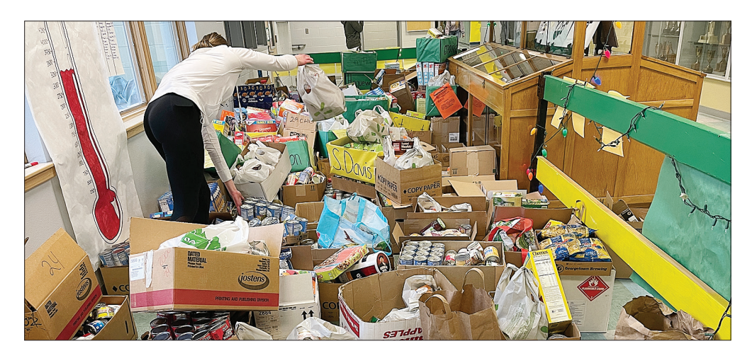
Members of the Pendleton High School Leadership Class help tally and sort donations for the annual food drive. The December 2021 effort resulted in the collection of 10,478 food items, which will be distributed through local food banks.

A Pendleton High School hallway near the office served as a "food corral" in December 2021 as members of the Pendleton High School Leadership Class helped organize donations for area food banks.