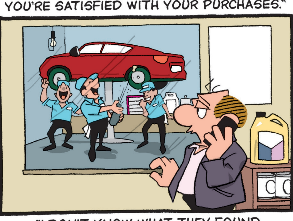
"I DON'T KNOW WHAT THEY FOUND, BUT IT DOESN'T LOOK GOOD."