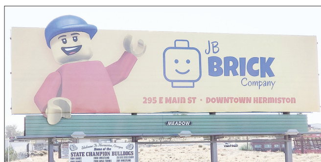
A billboard on Highway 395 in Hermiston advertises the Lego shop in Hermiston in October 2021. The billboard is larger than the sales floor of the shop.

According to the city’s press release on Artz’s new role, Hermiston has 15 parks that cover more than 100 acres, 10 miles of trails and a community center that hosts more than 200,000 event and program participants each year.