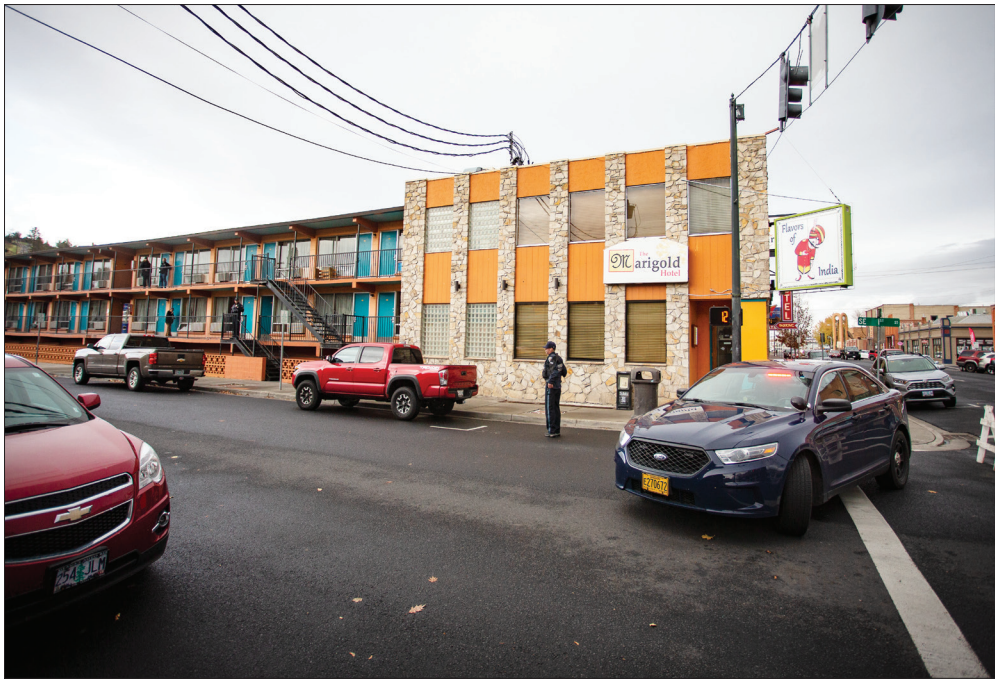
Ben Lonergan/East Oregonian