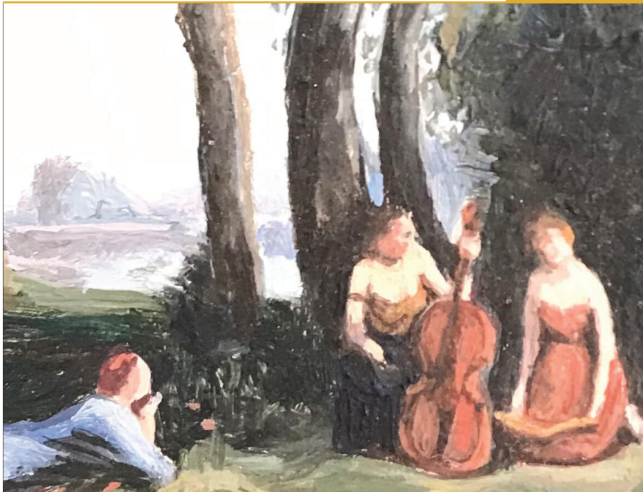
This miniature painting on wood by Nell Parker, measuring just 3 inches, will go to the highest bidder during the PCA's online auction.