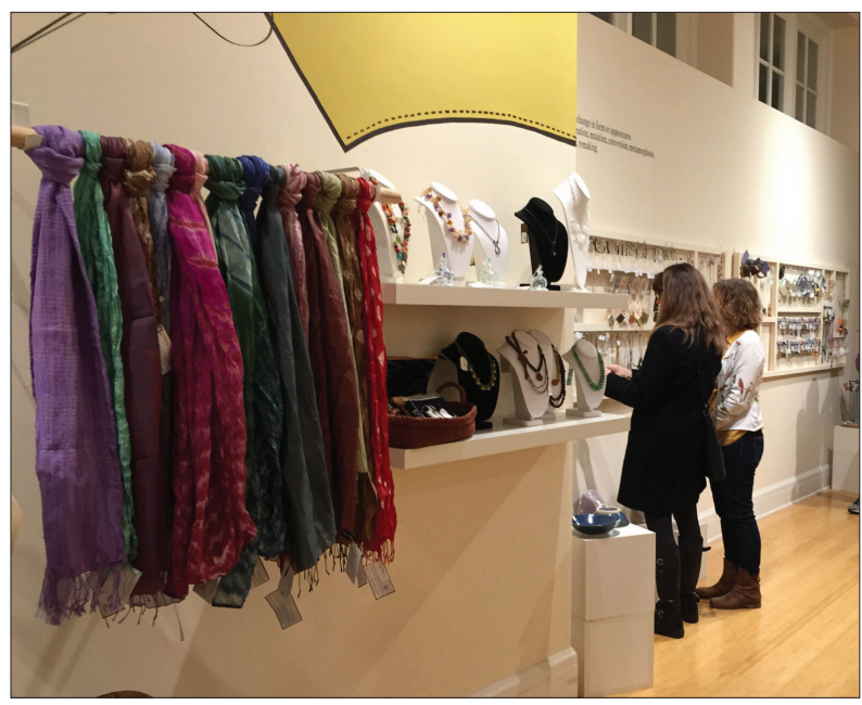
Pendleton Center for the Arts' annual "The Art of the Gift" exhibit and shopping event runs Nov. 18-Dec. 31.