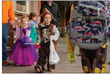
Pendleton's downtown trick-or-treat event is Saturday, Oct. 30, from 3-5 p.m.

• La Grande's Downtown Trick-or-Treat happens on Friday, Oct. 29, from 4-6 p.m. Streets in the heart of downtown (including Adams Avenue from Third Street to Greenwood Street, and all side streets from Washington to Jef-