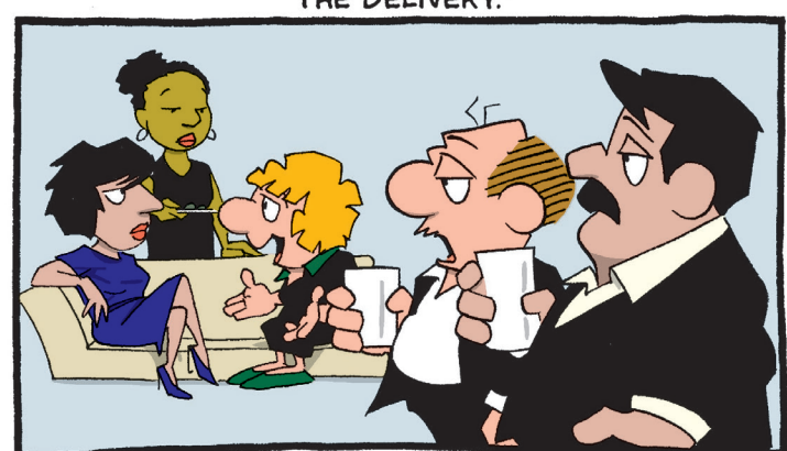
"ALL HURRICANES SHOULD BE NAMED AFTER MY WIFE."