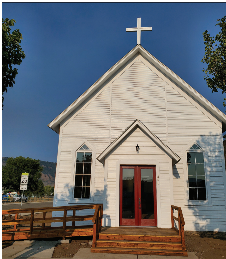
Union's Little White Church, owned by the Union County Museum, is available for weddings and events.