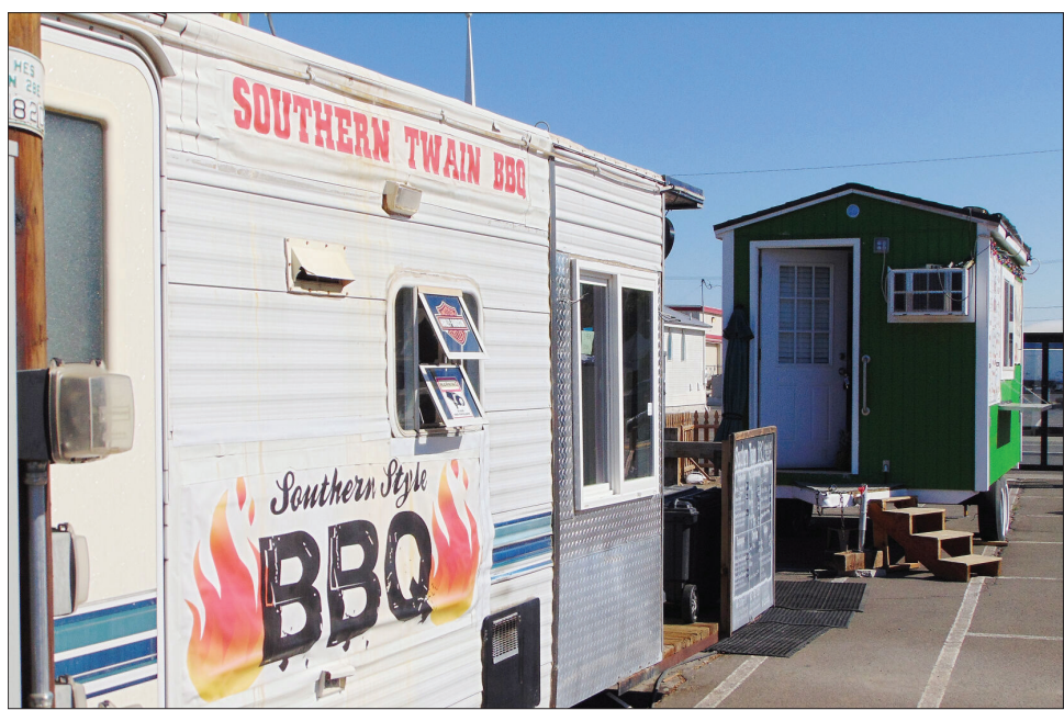
Southern Twain BBQ will close at the end of September 2021 as the Hermiston Food Pod undergoes renovations.