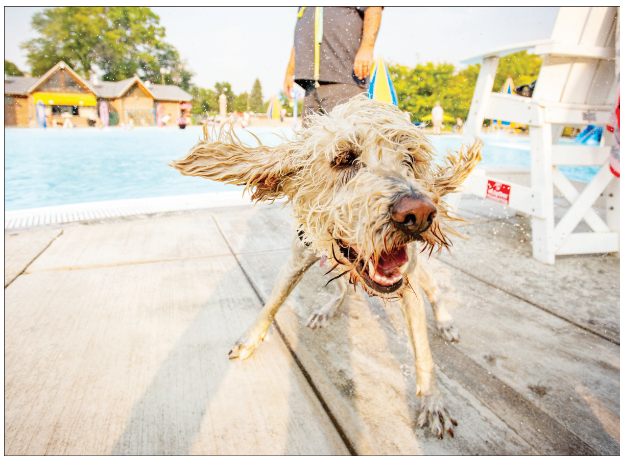
Stella, a 5-year-old Labradoodle, shakes off after chasing down a ball in the pool Wednesday, Sept. 8, 2021, during the annual Doggie Dip Day at the Pendleton Family Aquatic Center.