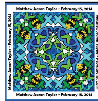
Learn how to "kaleidoscope" your name at a workshop Oct. 21 at Crossroads Carnegie Art Center in Baker City.

The class is for all ages, although children younger than 12 must be accompanied by an adult.