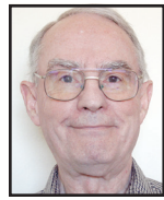
BRUCE BARNES BLOOMIN' BLUES

Name: Scarlet Gilia or Skyrocket Gilia Scientific name: Ipomopsis aggregata