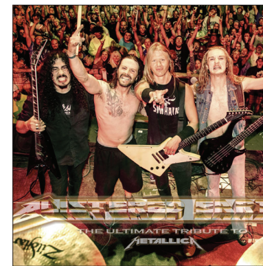
Metallica tribute band Blistered Earth plays at Baker City's Ison House Friday, Sept. 3.

"The word really spread. Eventually it got back to Metal-