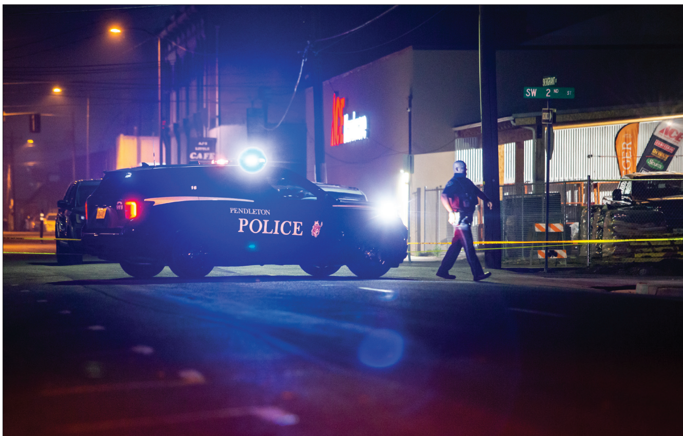
A law enforcement officer walks toward the scene of a shooting Friday, Aug. 13, 2021, at the corner of Southwest Emigrant Avenue and Southwest Second Street in downtown Pendleton.

The shooting occurred shortly after 7 p.m., accord-