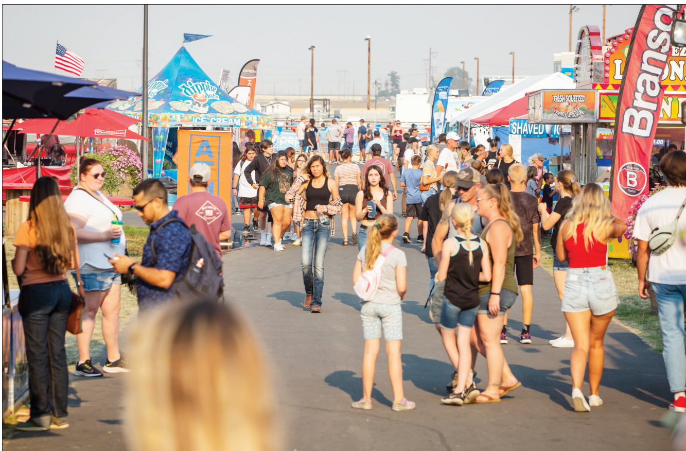
Fairgoers wander the Umatilla County Fair in Hermiston on Thursday, Aug. 12, 2021.