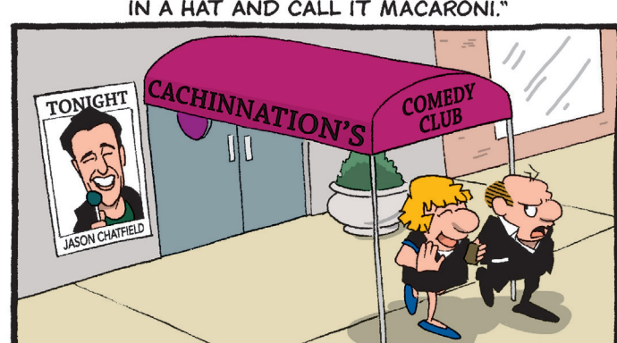
"IT WAS BAD ENOUGH YOU LAUGHED WHEN HE INSULTED ME BUT DID YOU HAVE TO YELL 'ENCORE'?"