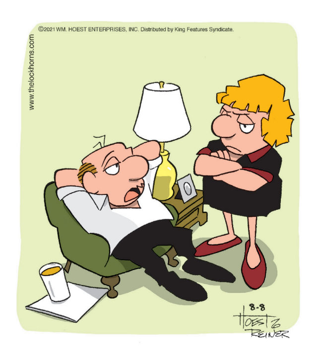
"WE HAVE STANDING DESKS AT WORK NOW, SO I'M MAKING UP FOR IT AT HOME."