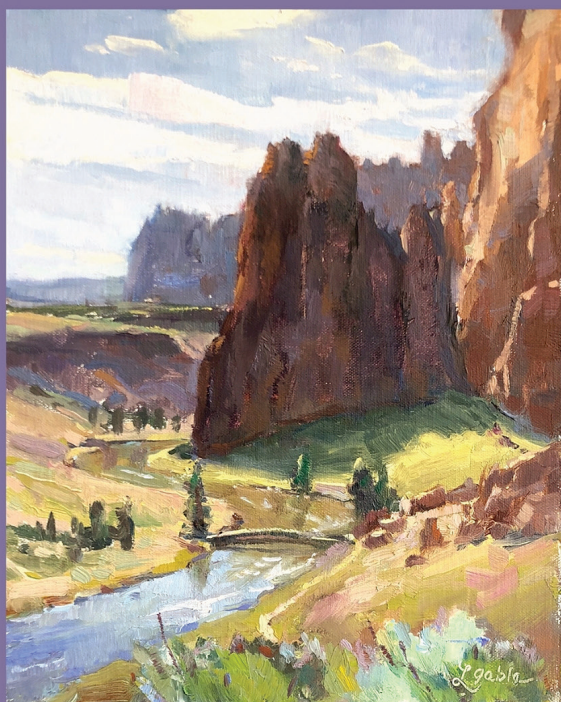
Laura Gable, Pinnacles at Smith Rock, Oil on Panel, 10" x 8"

Saturday, Aug. 7 Rodeo grounds in Haines Gates open at 4 p.m. Derby starts at 6 p.m. $15 adults, $10 seniors and military, $5 ages 5-12