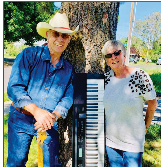
Barefoot & Bonafide plays Saturday, July 31, in Baker City.

Hermiston-based Brass Fire plays jazz, funk, blues, rock and swing in the Eastern Oregon