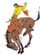
Pendleton High School