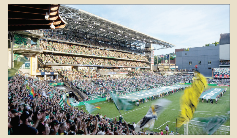
Oregon State plans to move its Sept. 17, 2022, home game against Montana State from Reser Stadium to Portland's Providence Park.

The Beavers regularly played in Portland during the 1960s and 1970s.