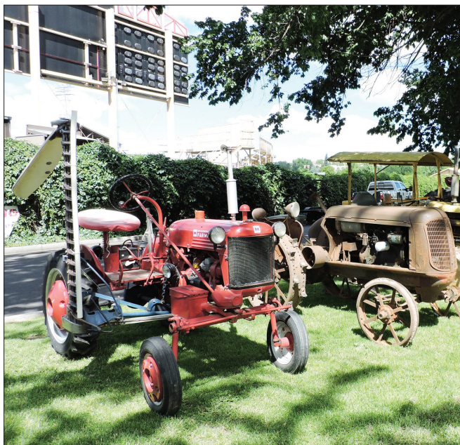
A row of tractors are lined up at Roy Raley Park in Pendleton as a part of the 16th Old Iron Show. This year's event runs Friday through Sunday, June 4-6, 2021, and features old iron engines, antique cars other machinery from bygone eras.

Those planning to attend are invited to bring your articles of devotion (such as rosaries, holy cards) and pictures of ill friends/family members, which you will be able to touch to the reliquaries as a means of intercession. The exposition is directed