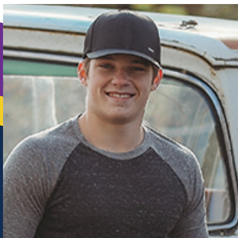
Jackson Lehman Heppner High School