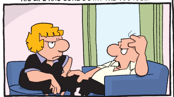
"TO SAVE TIME, WHY DON'T YOU CONSOLIDATE ALL YOUR COMPLAINTS INTO ONE BIG GRIPE?"