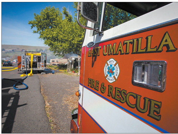
A firetruck from East Umatilla Fire & Rescue provides mutual aid at a structure fire in Pilot Rock on Wednesday, May 5, 2021.