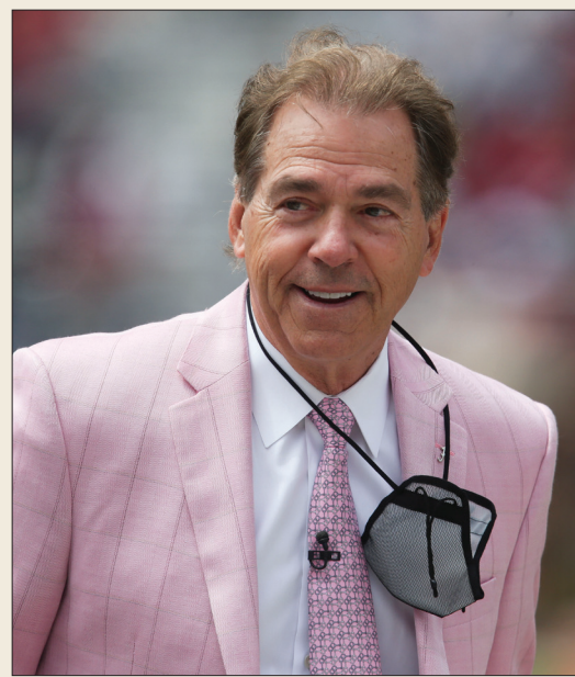
Alabama head coach Nick Saban watches during Alabama’s spring NCAA college football game at Bryant-Denny Stadium on April 17, 2021, in Tuscaloosa, Ala.