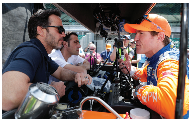
NASCAR driver Jimmy Johnson, left, and IndyCar driver Scott Dixon, right, talk during practice for the Indianapolis 500 IndyCar auto race at Indianapolis Motor Speedway in Indianapolis on May 16, 2019.

BIRMINGHAM, Ala. — Jimmie Johnson, Scott McLaughlin and Romain Grosjean, oh my! That's quite the rookie class for IndyCar, which opens the season Sunday, April 18, at Barber Motorsports Park stacked with storylines throughout the grid.