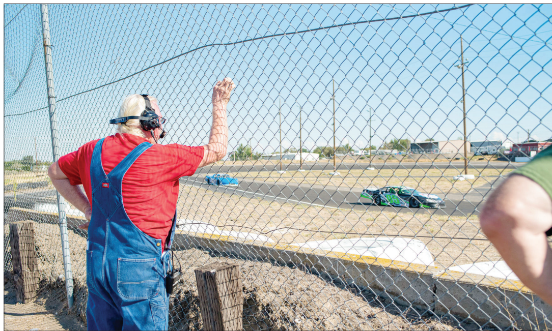
East Oregonian, File Pit crew members look on as drivers make some practice rounds in 2019 ahead of Hermiston Raceway's Labor Day Spectacular event.