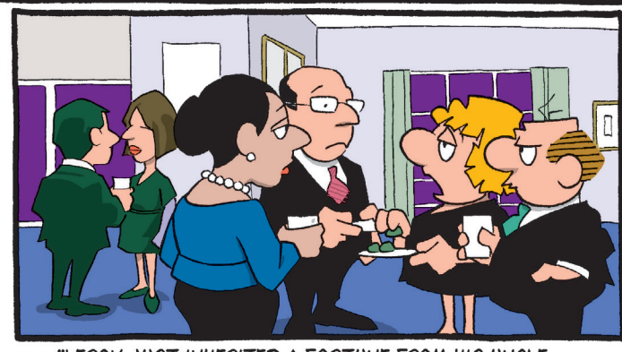
"LEROY JUST INHERITED A FORTUNE FROM HIS UNCLE ... I THINK IT WAS THE JULY 2017 ISSUE."