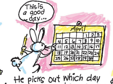
Easter, and always makes