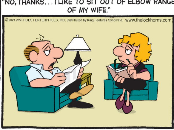
DO YOU WANT TO GO OUT TO EAT, SEE A MOVIE OR PAY THE CABLE BILL?"