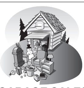
Advertise it here

kVJdz09 Meeting ID: 857 3571 5277 Passcode: 435374 Publish April 1, 8, 2021