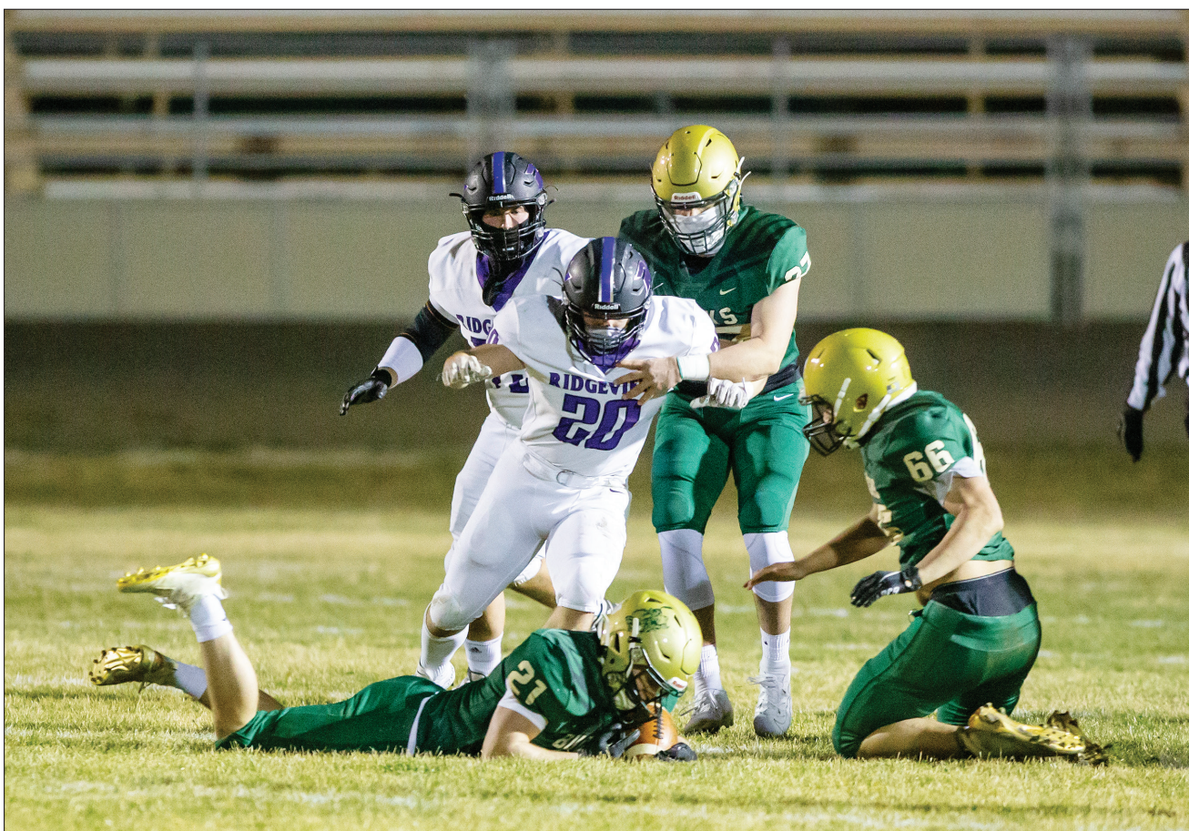
Ben Lonergan/East Oregonian