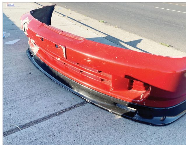
This photo shows the damaged bumper of a vehicle left behind at the scene of a fatal hit-and-run in Hermiston in 2019.

cine. Times vary by store. Vaccines are available to those currently eligible under Oregon Health Authority guidelines, including those age 65 and up and certain professions.