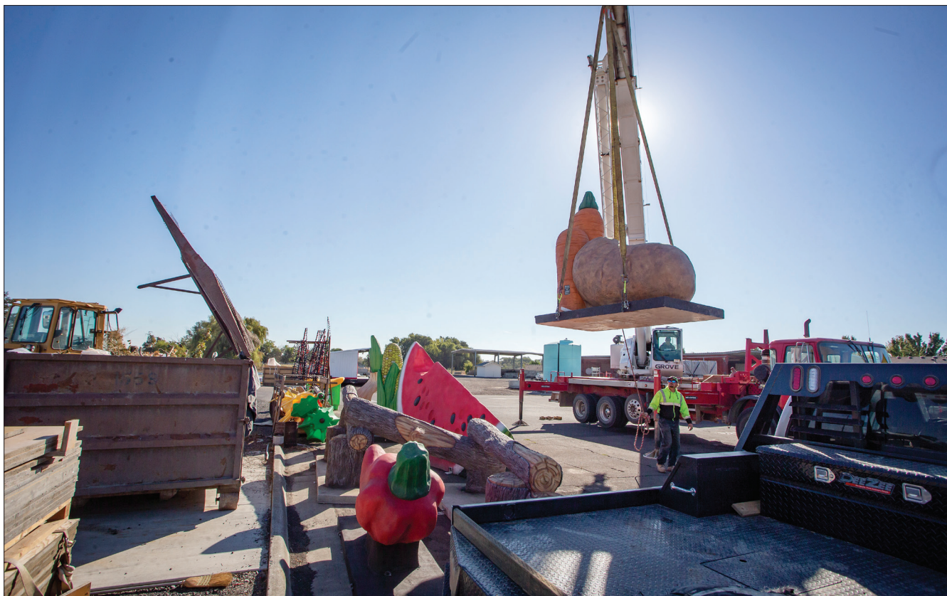
Workers unload giant produce at the city of Hermiston maintenance facility in Hermiston on Monday, Sept. 28, 2020. The larger-than-life replicas will be a part of the new Funland playground when it is completed.