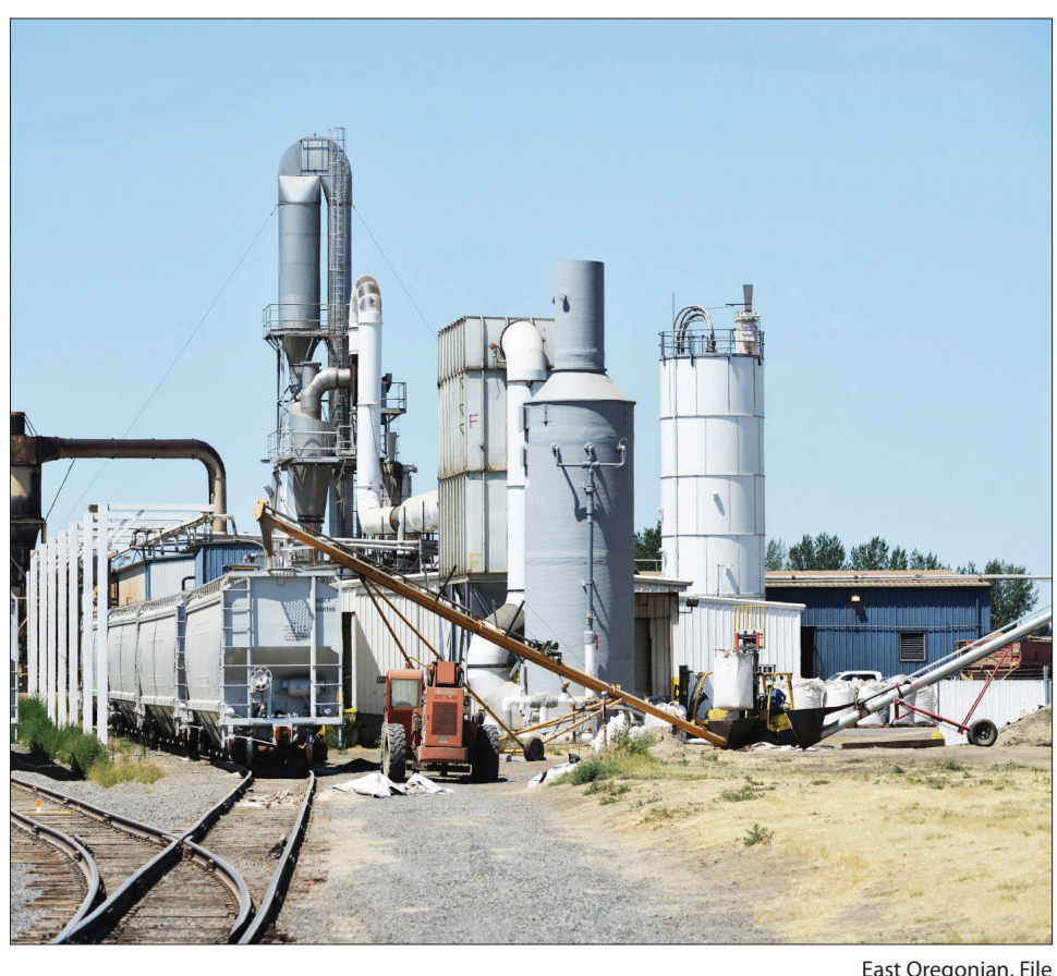
The 3D Idapro Solutions plant in Stanfield, pictured here in 2019 shortly before it closed, is the subject of a class action lawsuit that the company has agreed to settle.

"We've done everything we can to get ready," he said. "We're all dressed up with nowhere to go."