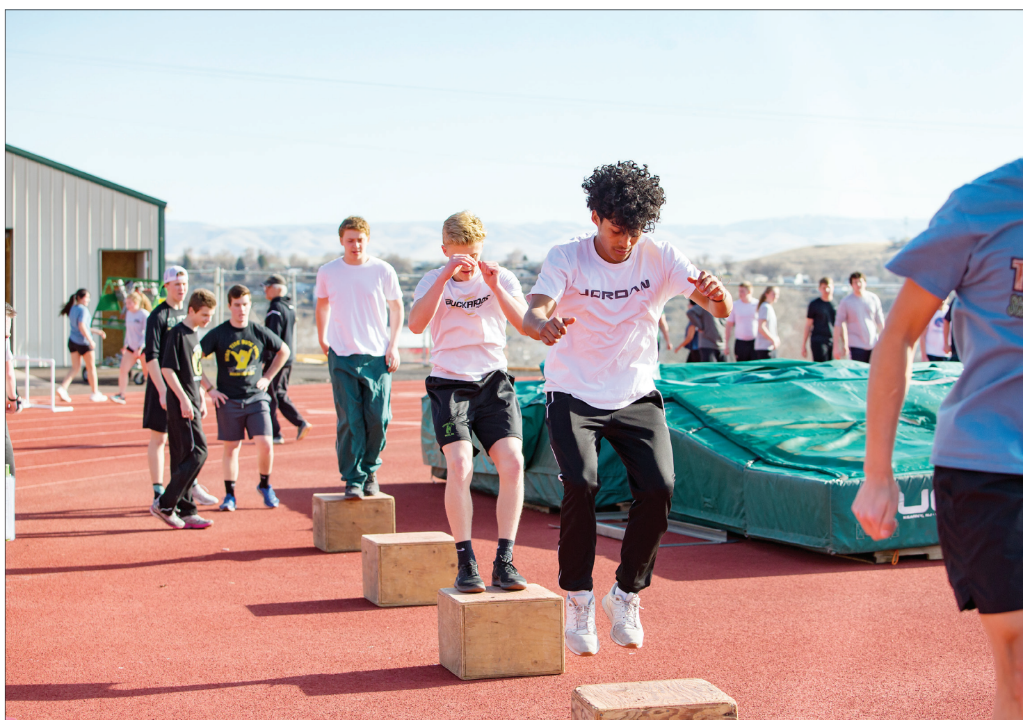
Student athletes work on drills during the Pendleton High School track practice on Thursday afternoon.