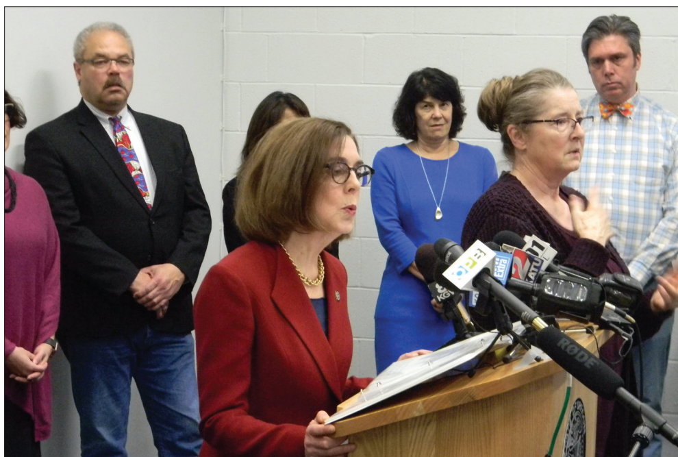
Gov. Kate Brown details steps Oregon is taking to limit the spread of COVID-19 at a press conference in Portland on Thursday.

In a speech to the nation, President Donald Trump announced a ban on travel to the U.S. from Europe. The administration and Congress are both weighing additional responses. On Thursday morning, Oregon Gov. Kate Brown banned large gatherings in the state. Major universities shifted to remote classes for 80,000 students and local schools were urged to cancel events. Now, several planned local gatherings are also being canceled and the newspaper is com-