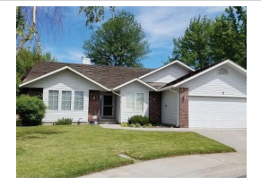
Excellent 3 bedroom home located at 3 SE Crestline PL. Hermiston Asking $305,000

Coldwell Banker Whitney & Associates 541-276-0021