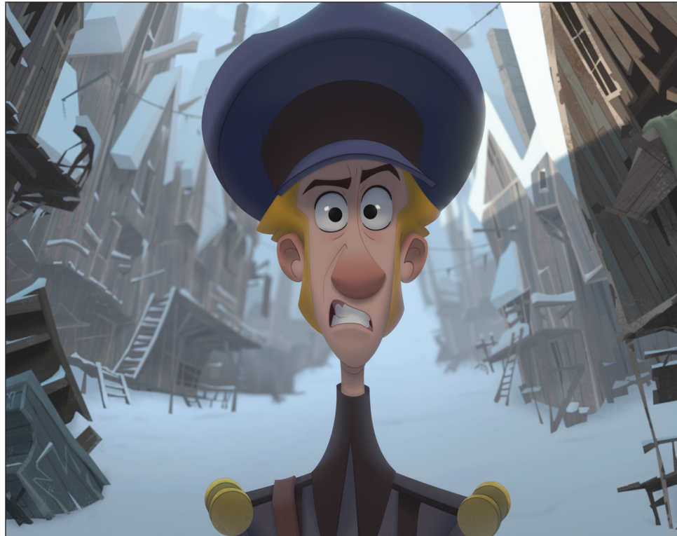
A scene from "Klaus"

Christmas comes early when heartwarming holiday story premieres Friday, Nov. 15. "Klaus" tells the story of a postman named Jesper (Jason Schwartzman, "Wine Country," 2019). He was the postal academy's worst student, and therefore is stationed in the town of Smeerensburg in the Arctic Circle after graduation. Smeerensburg is far from a friendly place, and the locals are perfectly content to be live in a town known as the "unhappiest place on Earth." Their status begins to change when Jesper discovers the reclusive toy maker Klaus (J. K. Simmons, "Spider-Man: Far from Home," 2019), and sets a series of good deeds in motion. He asks Klaus to donate some of his toys to the children in town, and offers to deliver them himself. The children are overjoyed, and they begin to write letters to Mr. Klaus to thank him for his generosity. However, the adults in town are unmoved, and they strongly oppose Klaus and Jesper's efforts. They try to stop the charitable duo by destroying as