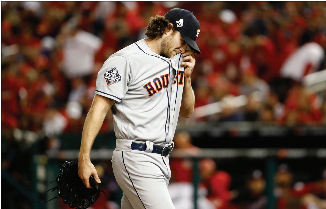
Houston Astros starting pitcher Gerrit Cole walks to the dugout after the third inning of Game 5 of the baseball World Series against the Washington Nationals on Oct. 27, 2019, in Washington.

Cole, Rendon and Strasburg all are represented by Scott Boras, known for slow, methodical negotiations. Last winter, he reached outfielder Bryce Harper's $330 million, 13-year contract with Philadelphia on Feb. 28.