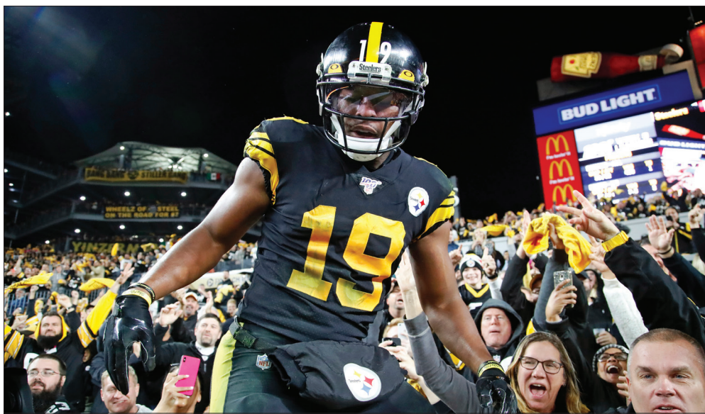
Pittsburgh Steelers wide receiver JuJu Smith-Schuster (19) climbs down from the stands after celebrating his touchdown with fans during the second half of Monday's game against the Miami Dolphins in Pittsburgh.

Pittsburgh (3-4) spotted the Dolphins (0-7) a 14-point first quarter lead before steadying itself to win consecutive games for the first time since ripping off six straight in the middle of last season. Steelers safety Minkah Fitzpatrick, acquired in a trade with Miami last month, picked off Dolphins quarterback Ryan Fitzpatrick twice, and Pittsburgh forced four turnovers in all to avoid an embarrassing loss that would have effectively ended the com-