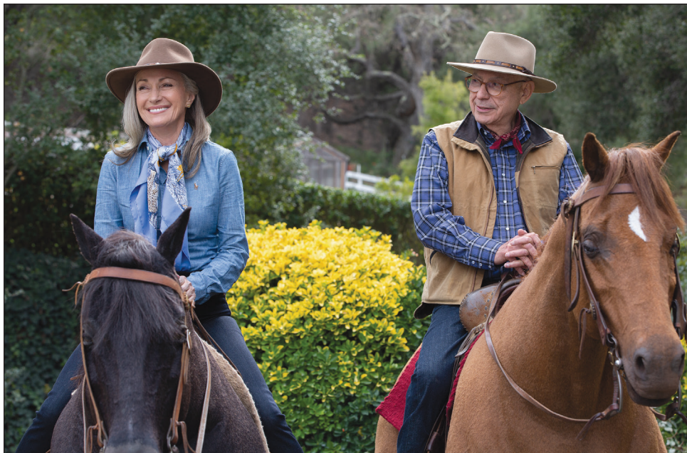
Jane Seymour and Alan Arkin in a scene from "The Kominsky Method"