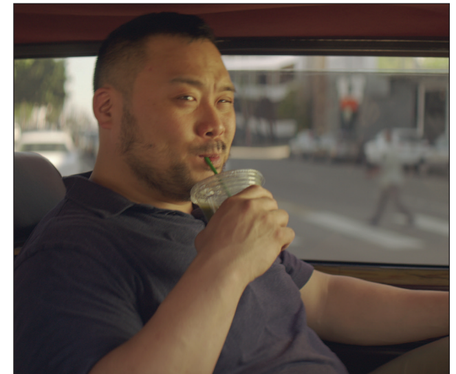
David Chang in "Breakfast, Lunch & Dinner"