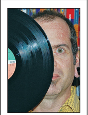
JOHNNY VINYL RIDE THE VIBE