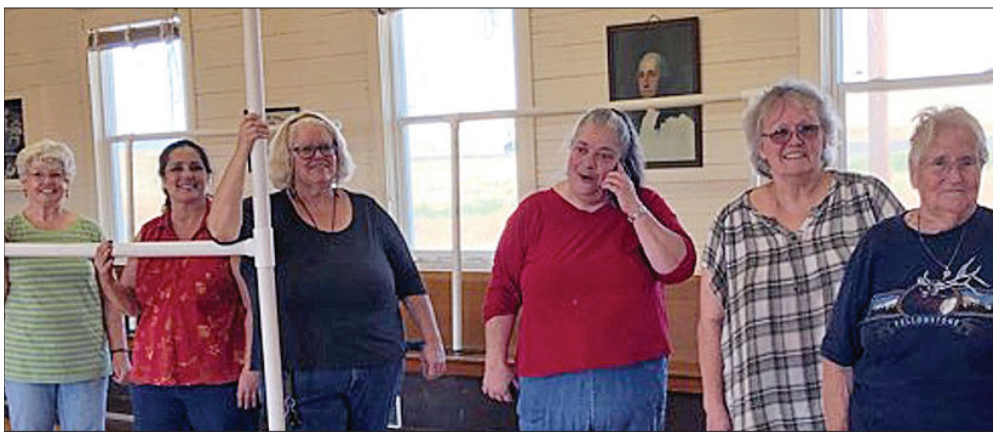
Organizers prepare for the Rocky Ridge Quilt Show , held Aug. 17 at the White Eagle Grange Hall , near Pilot Rock.