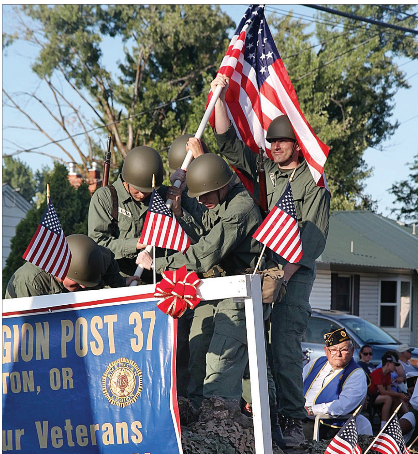
American Legion Post 37 reenacted the iconic image of the raising of the flag on Iwo Jima on its float during the Umatilla County Fair parade.

For more information, visit www.oregon.gov/dps .